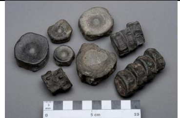
Ichthyosaur back bone